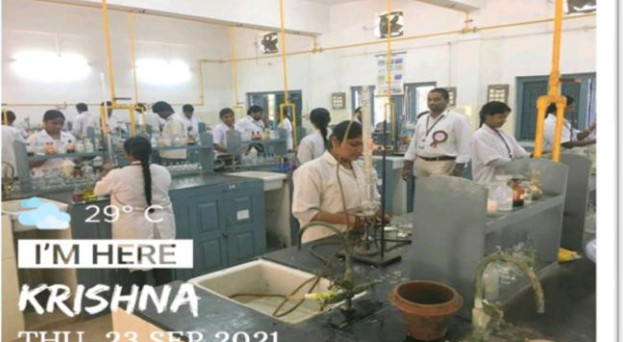
CHEMISTRY LAB P.G