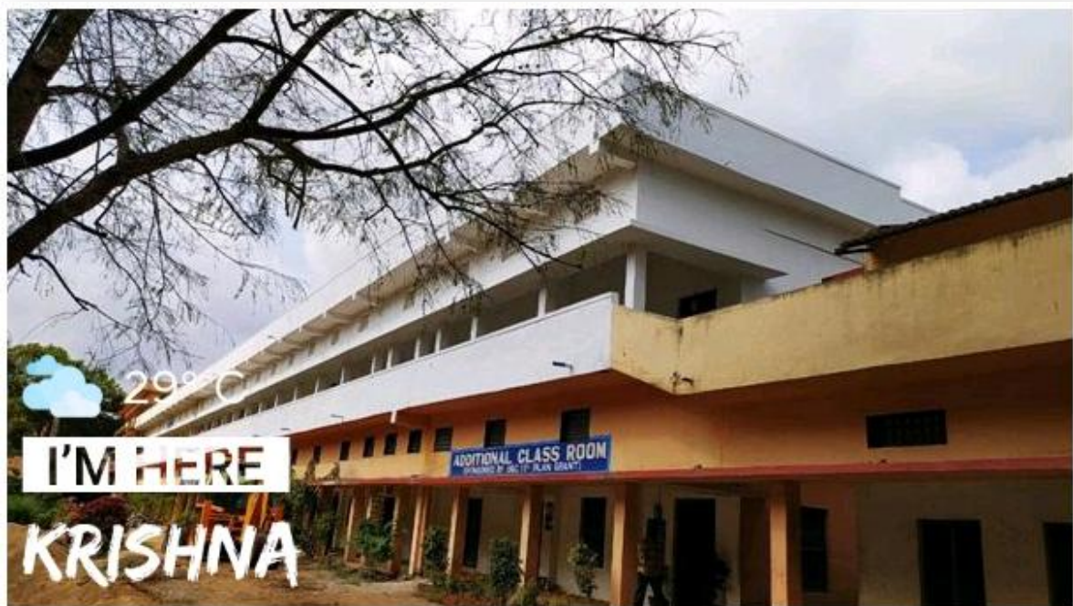
ADDITIONAL CLASSROOM BUILDING