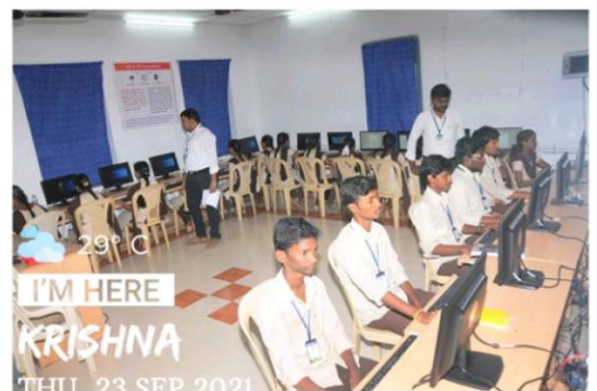
COMPUTER LAB P.G