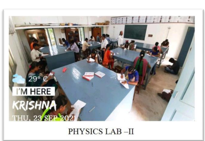
PHYSICS LAB -II