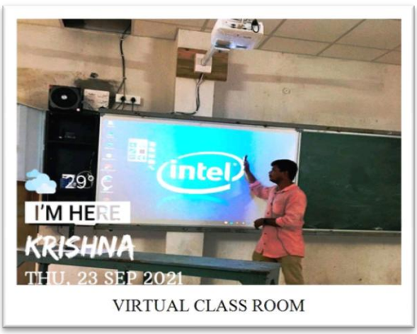
VIRTUAL CLASS ROOM