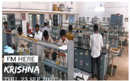
CHEMISTRY LAB U.G