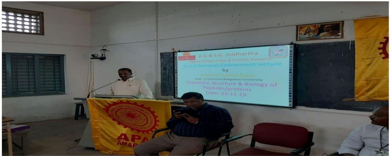
SMART DIGITAL PODIUM